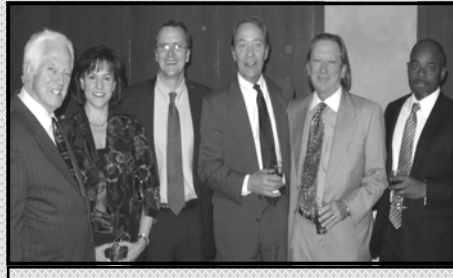
Enjoying the Cocktail Reception before the Tate Banquet.